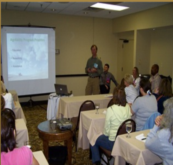
Agrability Staff presenting at the annual conference.